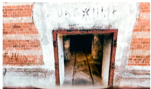
Figure 3 Still of a NeRF rendering of a Soviet building

Through the amalgamation of photogrammetry and NeRF visual rendering, combined with affective narratological design, haunting music score, and temporal components, the authors of this text created the installation Triunes of Displacement to demonstrate the efficacy of their integrated approach. The framework established considers the audience's psychological response to objects of Latvian nostalgia, influencing emotional response. The interconnection of these cognitive, emotional and placial symbols supports the authors' intent to produce holistic visualizations that are representative, emotionally resonant, and technically impactful.