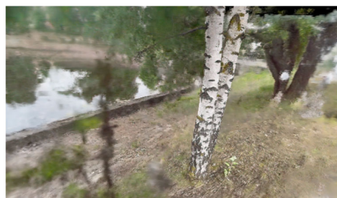
Figure 5 trees

Complementing the visual elements of the Triunes installation is a hauntingly monophonic musical score. As Ceplitis [11] observes in “The Curious Aspects of Audionarratology in Stereoscopic Cinematic VR,” sound plays a pivotal role in amplifying the immersive effects within virtual reality spaces. Along with the volumetric visualizations discussed in this text, the artwork's original score targets the deep emotional core of viewers, potentially evoking diasporic sensibilities through a binary narrative structure. The composition begins with a rather vibrant, complex, and bright textural element written in the key of F major and featuring a crisp staccato articulation and syncopated rhythms using vibraphone crescendos (Fig 6) that contribute to its lively, energetic mood. Gradually, however, the initial exuberance transitions into darker themes reminiscent