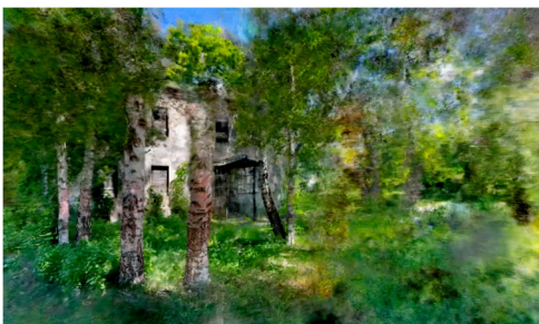
Figure 2 NeRF rendering of a pastoral Latvian scene

who have been personally impacted by displacement and are witnesses to the dislocation process. To this end, the development of NeRFs and point cloud models echoes the symbolic significance of landscapes where the visual deconstruction of place provides insight into a community's gradual disconnection from belonging as an immersive and visceral testimony to foreboded events (Fig. 3).