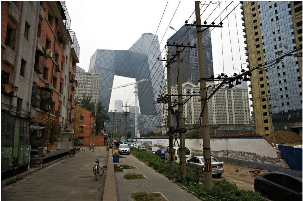
Figure 4. CCTV headquarters by OMA, Rem Koolhaas, Beijing (Rotterdam: OMA, 2012)