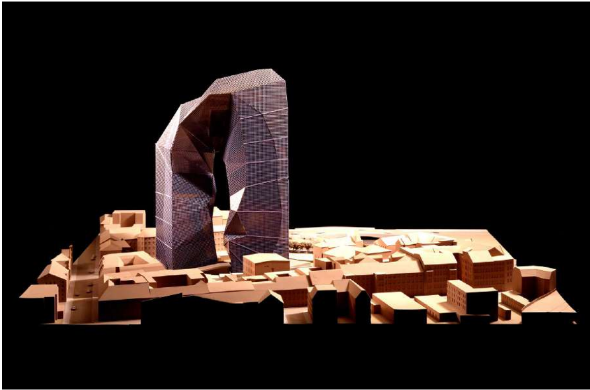
Figure 2. Peter Eisenman's proposal for the Max Reinhardt Haus, Berlin (USA: Eisenman Architects, 1992)

with their own theories and critical approach to architecture practise, which remain essential and urgent for the discourse. In addition to the subject debate, Supercritical includes two rare transcripts of talks given by Eisenman and Koolhaas, both articulating their ideas, which later served to influence their work and many other architects.