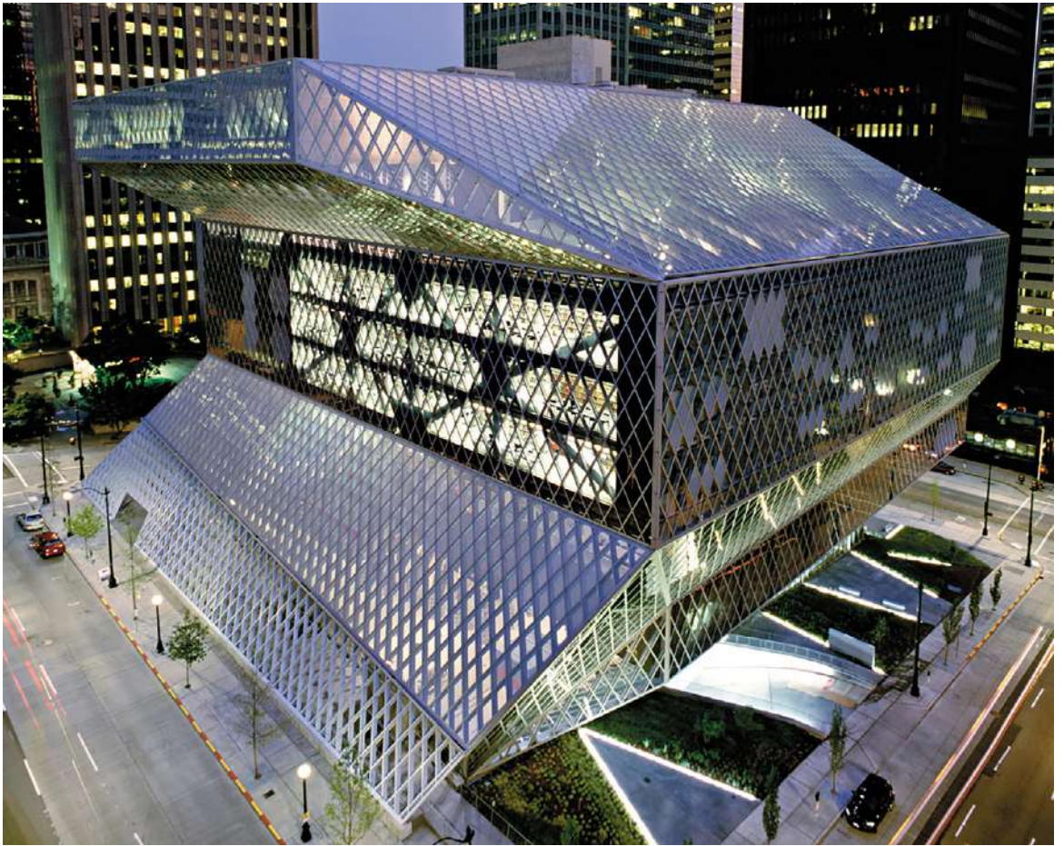
Figure 5. Seattle Central Library by OMA and Rem Koolhaas, Seattle (Rotterdam: OMA (photo: Philippe Ruault), 2004)